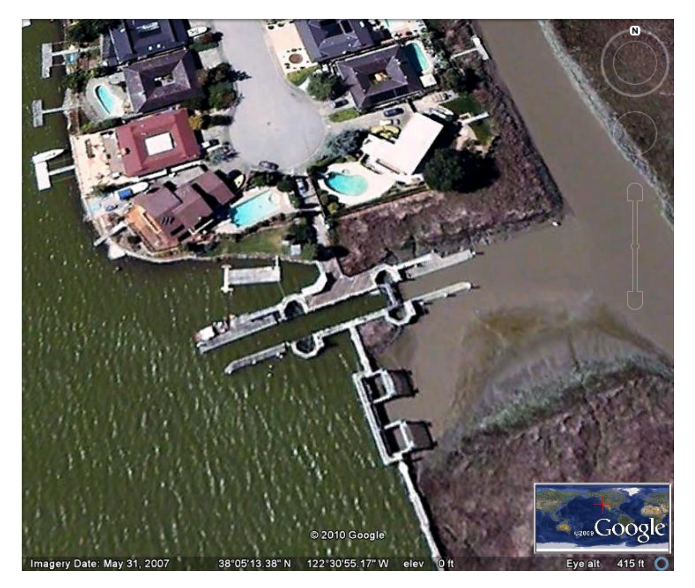
Google earth image of the north lock