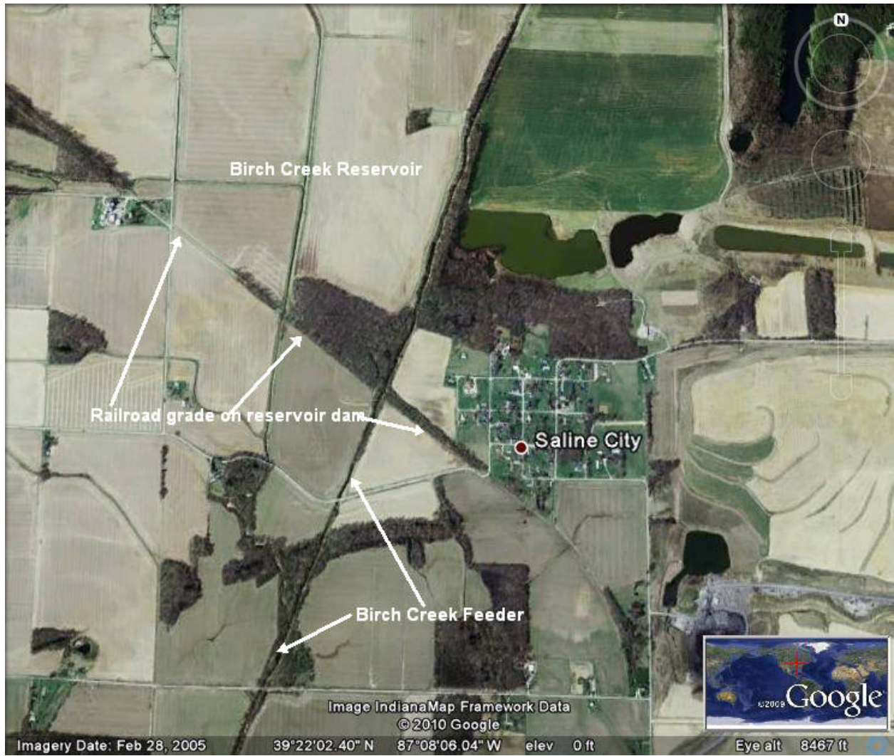
Birch Creek Reservoir and Dam at Saline City, IN