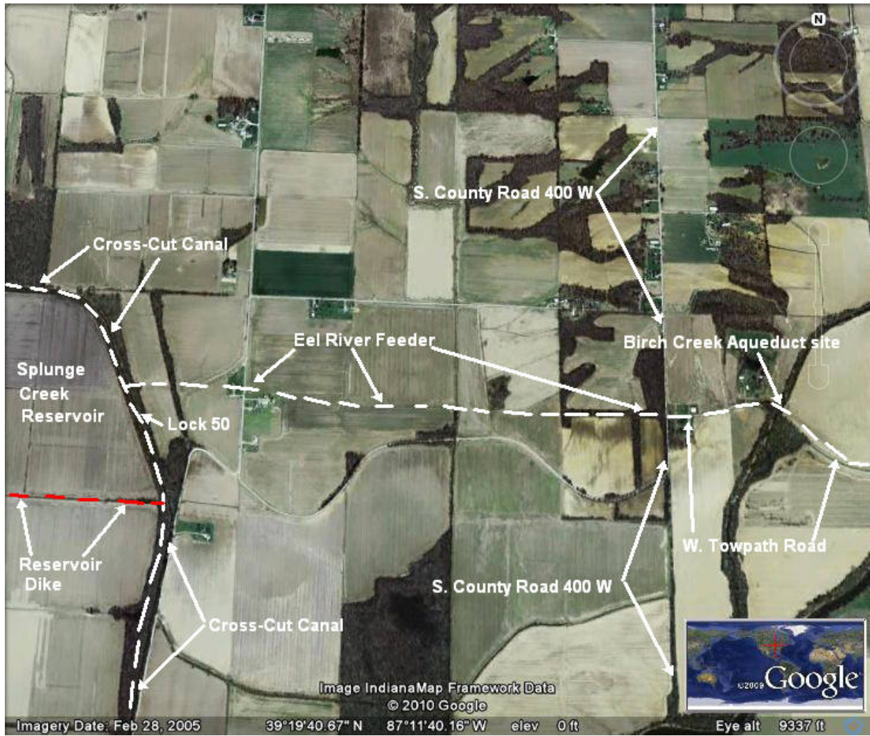
West end of Eel River Feeder