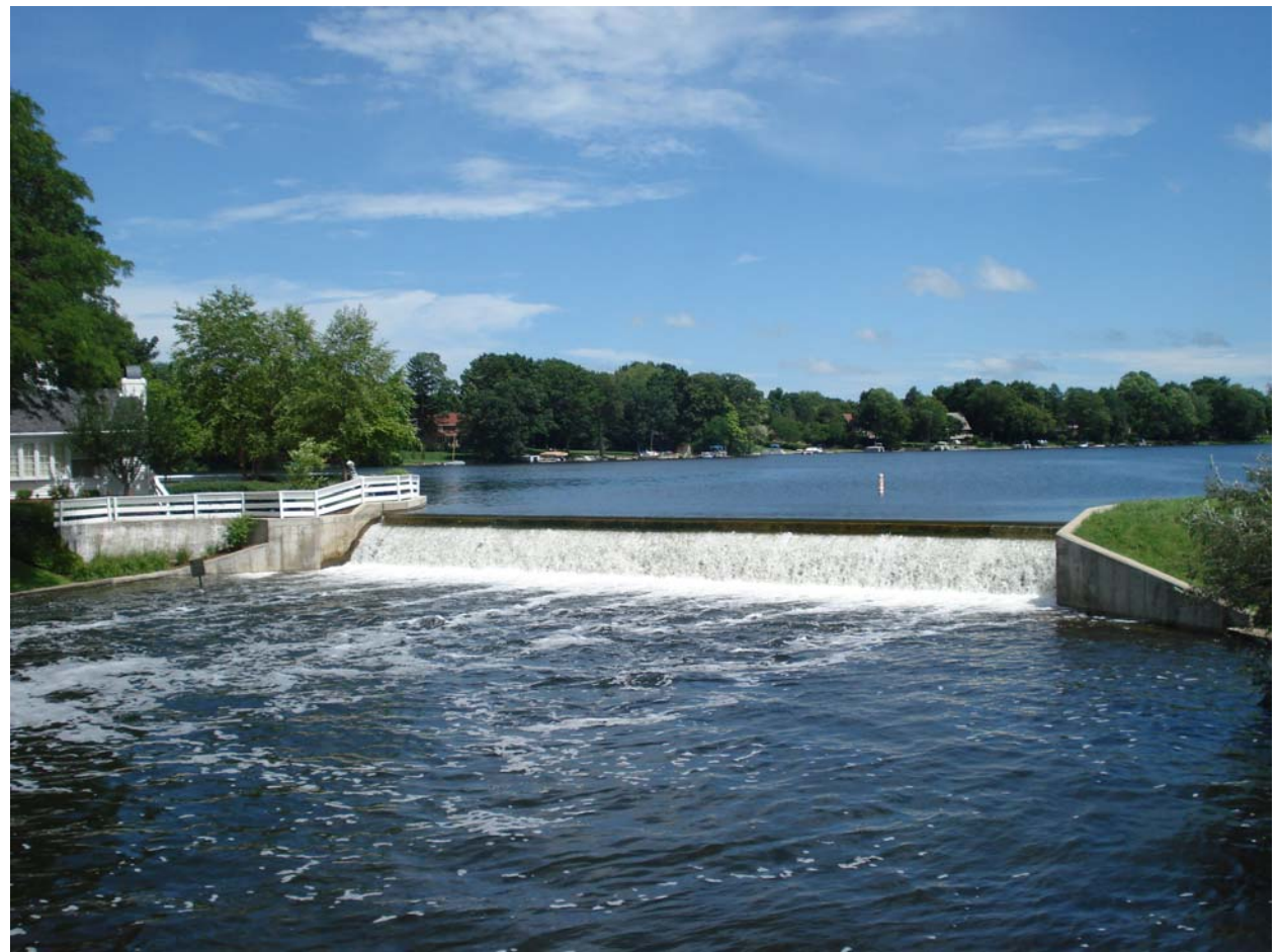
The dam from Fowler Lake to Lac La Belle at Oconomowoc, WI Most likely, the lock was to the left of the dam in this photo where a house now sits.