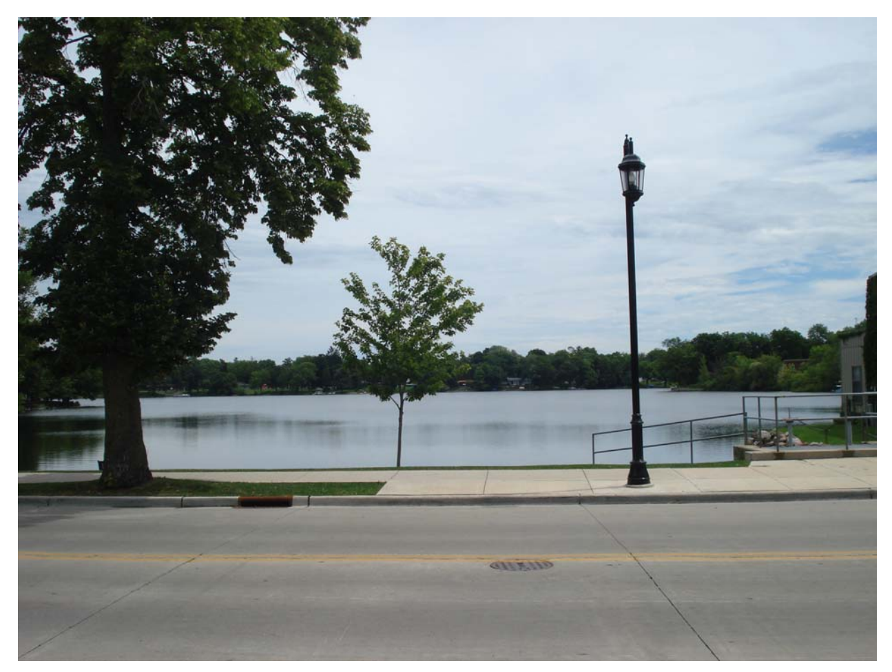
View across Main St., Oconomowoc, WI at approximate site of boat railway