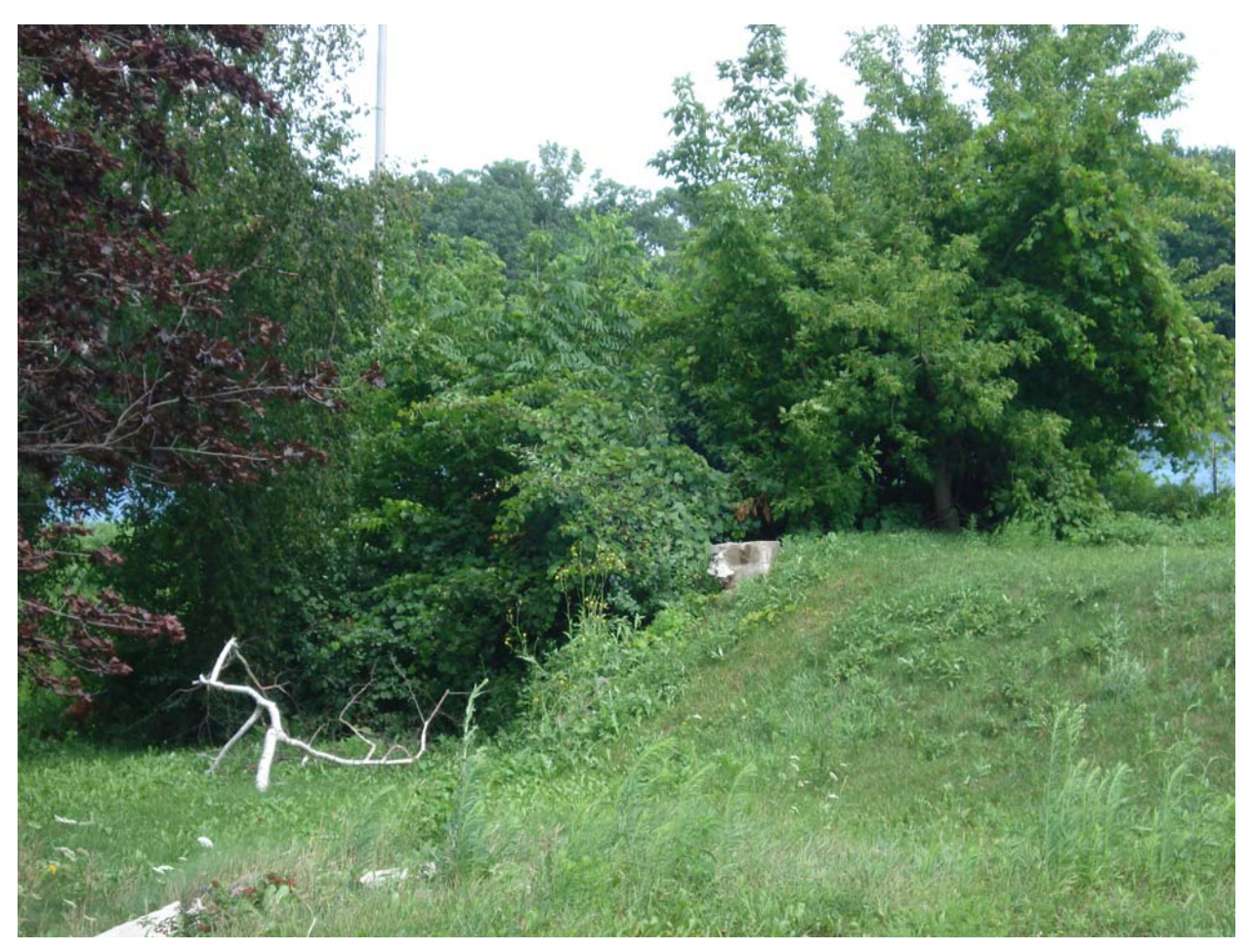
Close up of at tree covered foundation to the right of the dam. This is most likely part of the house that was on this now vacant lot.