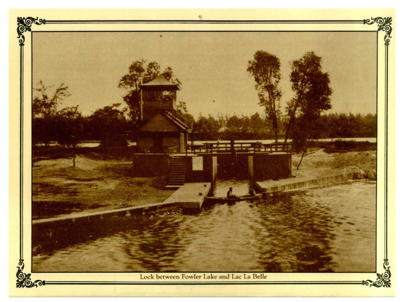
View of the lock between Fowler Lake (to the rear) and Lac La Belle, Oconomowoc, WI. Judging by the lay of the land, the dam is to the right of this view.