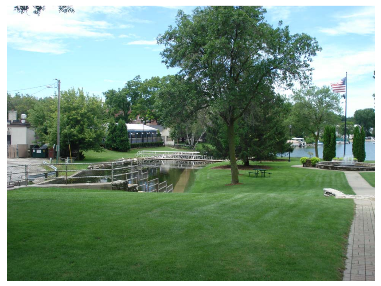
View in the opposite direction of approximate route of boat railway, Oconomowoc, WI