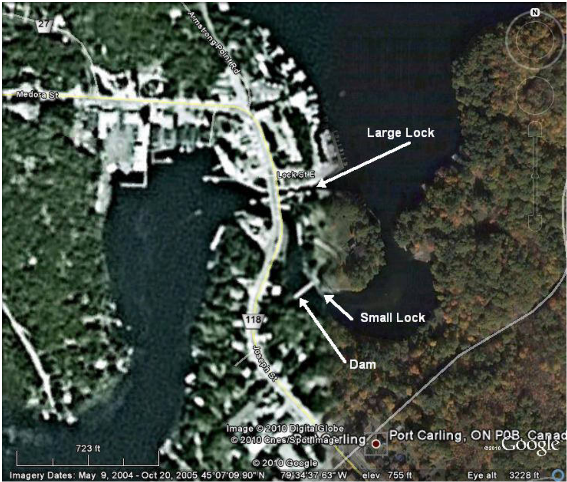
Google Earth view of Locks at Port Carling, ON There is a clearer view on Bing Maps