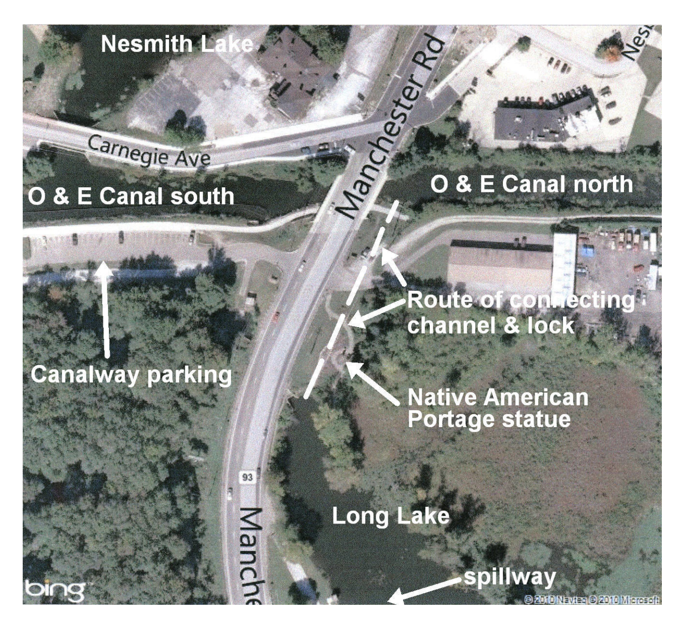
An aerial view of the site today. By canal, Akron is to the right and Barberton to the left.