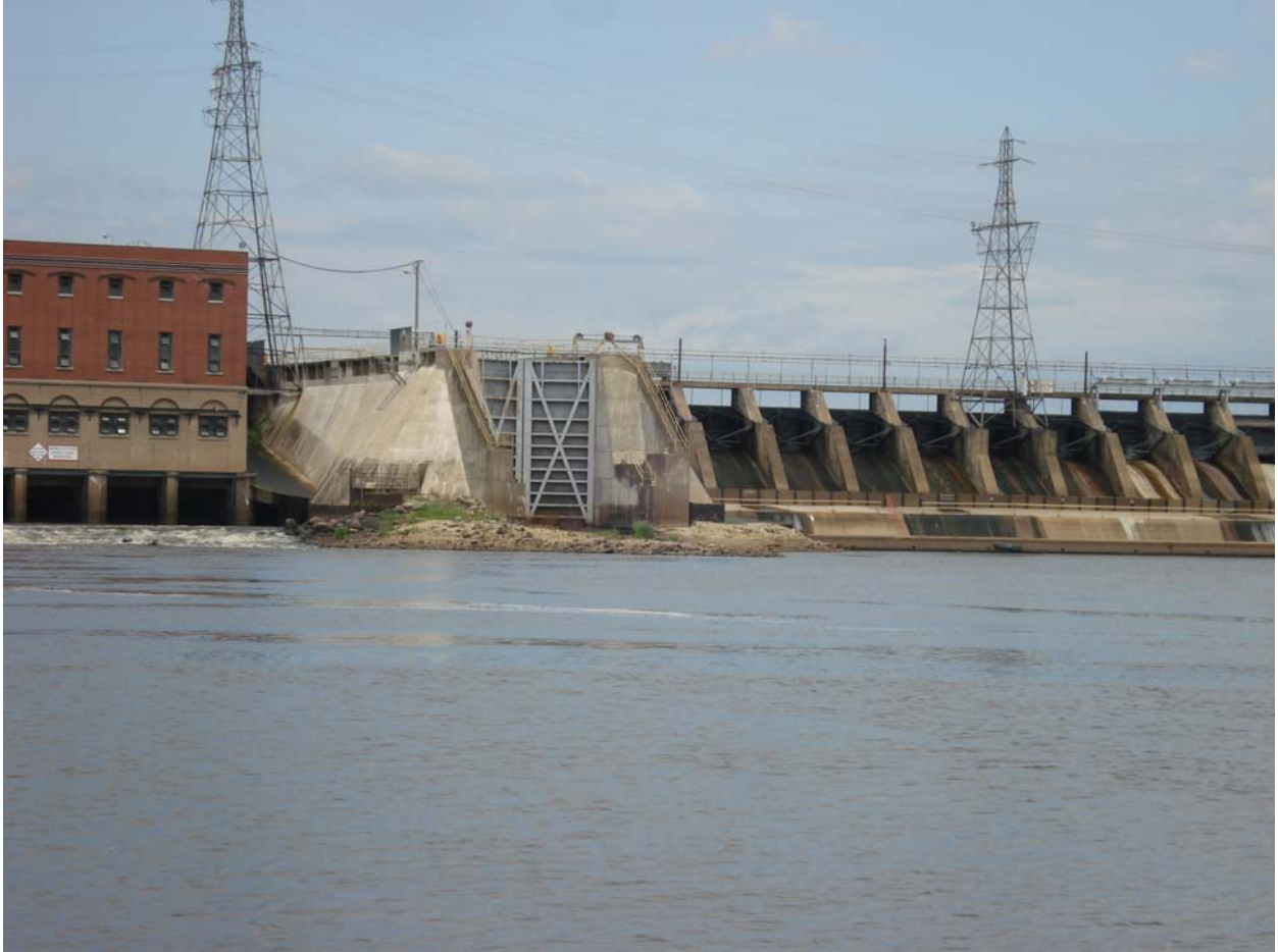
Down stream view of lock