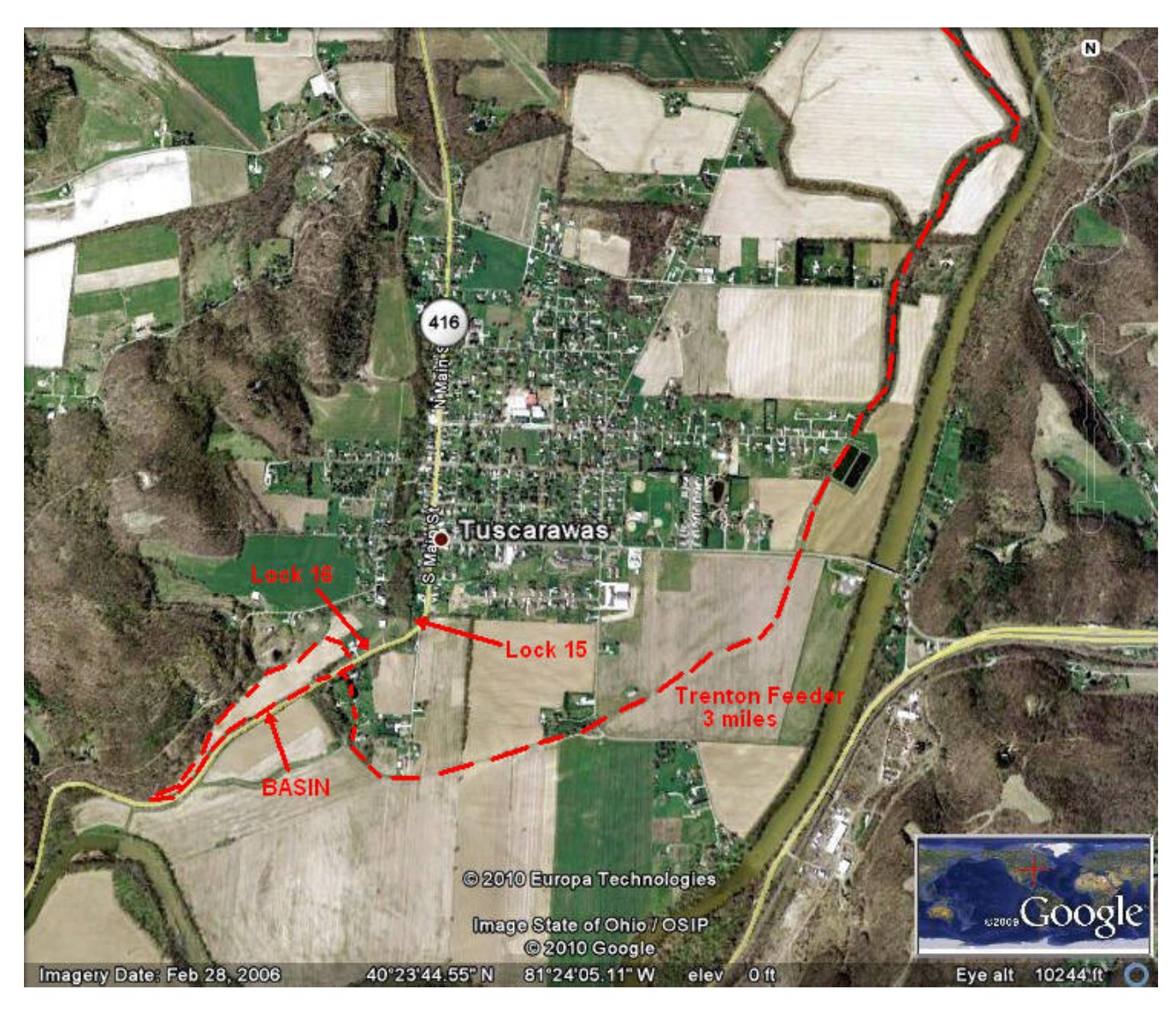
Lower end of Trenton Feeder