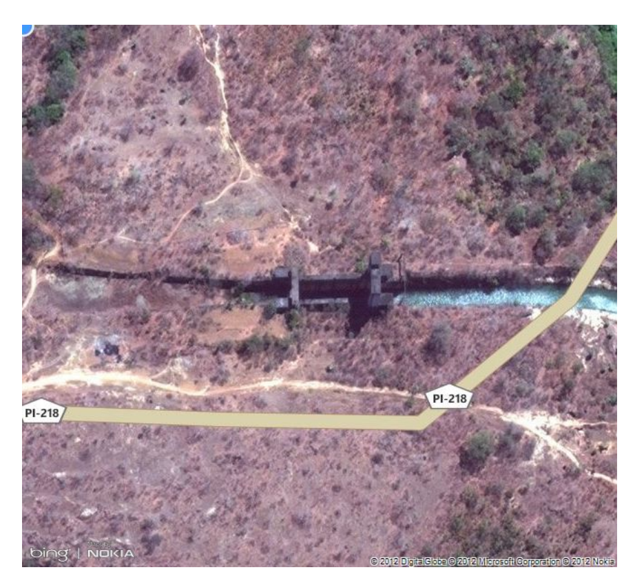
Lower lock at Boa Esperanca