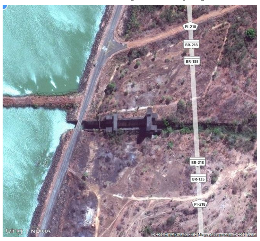
Upper lock at Boa Esperanca (Bing maps)