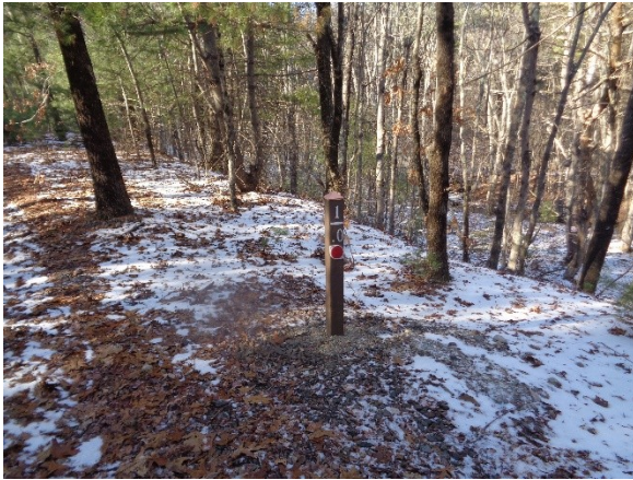
Mile marker 1.0 as viewed 1/6/16