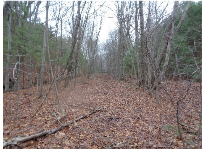
Looking the other way on 1/17/16, the SNETT grade rises gradually to the east. On the left edge (north side) is a drainage ditch that carries all water on the grade here to the west.

Applications and dues (payable to the Blackstone Canal Conservancy) should be sent to the Membership Secretary; Blackstone Canal Conservancy, 16 Ballou Road, Hopedale, MA 01747-1833