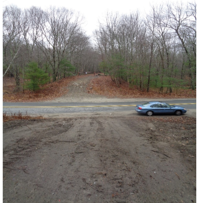
SNETT view eastward across West St., Uxbridge 12/18/15. In railroad days, there was a bridge over the road here.