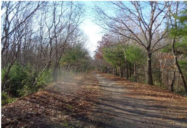
View looking westward along the SNETT just west of Grove St. in Franklin 12/26/15

On Saturday, November 7 th , the Franklin Bellingham Rail Trail Committee held a workday in conjunction with Department of Conservation and Recreation employees on the Southern New England Trunkline Trail between the eastern end at Grove Street and Spring Street in Franklin. DCR also did some prework and some post work cutting trees and chipping up the cuttings. The result is a now very open trail in that location.