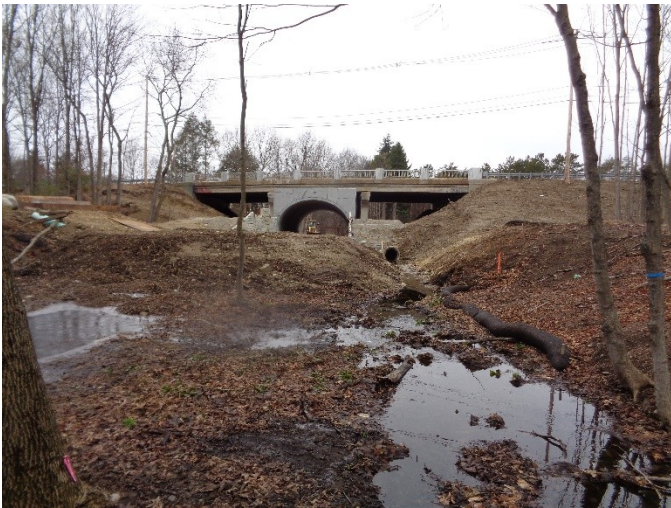
The new tunnel under Rte. 126 in Bellingham viewed 1/17/16.