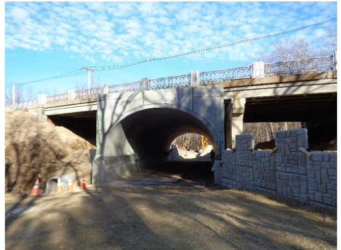
New SNETT tunnel under Rte. 126, Bellingham on 12/15/15 looking eastward. The bridge will be removed in mid-April.

In late March, the contractor returned and began work on the north side of the roadway. An article on the front page of the April 1 st , Milford Daily News reports that at 10 PM on Friday, April 15 th , the state will close the road to allow the contractor to remove the old bridge and install the new roadway over the tunnel. Detours will then be in effect. It is planned that the roadway will reopen at 5 AM on Wednesday, April 20 th . During the work, the elevation of the highway over the SNETT will be reduced to improve sight lines. While the article doesn't say so, it is expected that the highway will probably be repaved when it reopens. At that point, probably only sidewalk, landscaping and other finishing type work will remain.