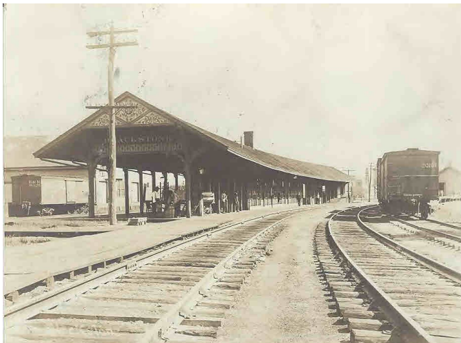
This photo is taken between the two P&W tracks and shows boxcars on sidings along both rail lines.

Two post cards views are below. Both are looking south along the P&W alignment from near the Blackstone River Bridge that is just north of the site.