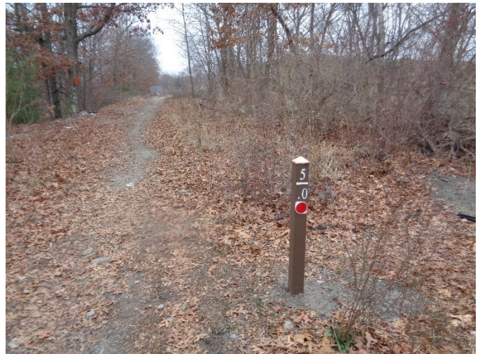
Mile marker 5.0 looking west to Woonsocket Junction with the fence around the landfill just before Farm St. in the background.