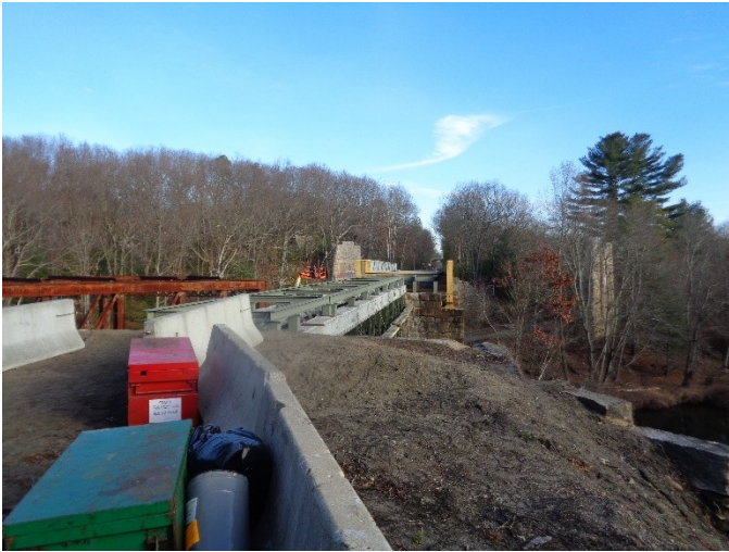
View eastward across the SNETT bridge at the Triad Bridges showing the new steel on 12/15/15.