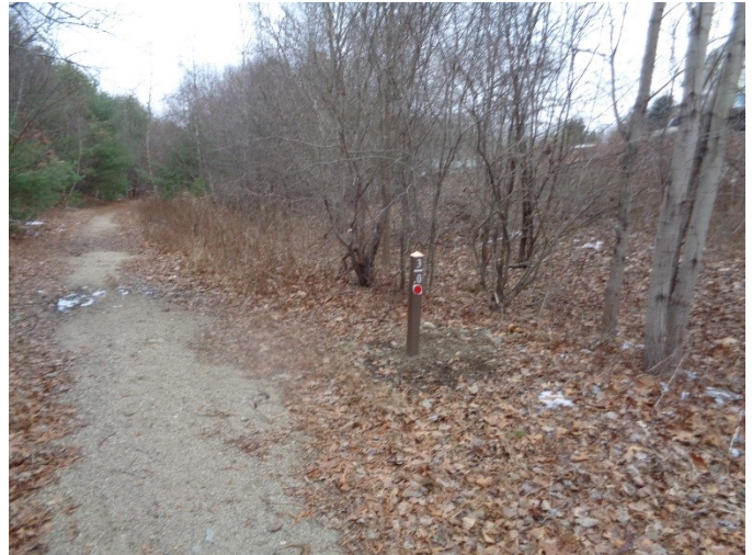
Mile marker 3.0 just west of Fox Run Road, Bellingham.