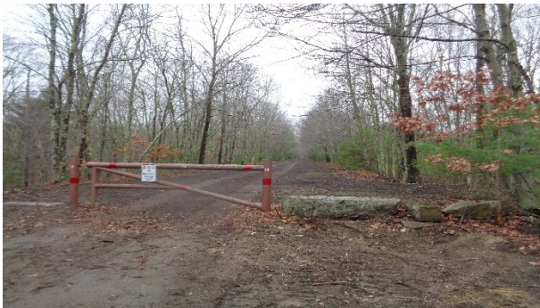
SNETT view westward at West St., Uxbridge 12/18/15

In early December, a contractor working in conjunction with the Bay State Trail Riders Association cleared and graded the SNETT from West Street, Uxbridge to Monroe St. in Douglas. The results show below.